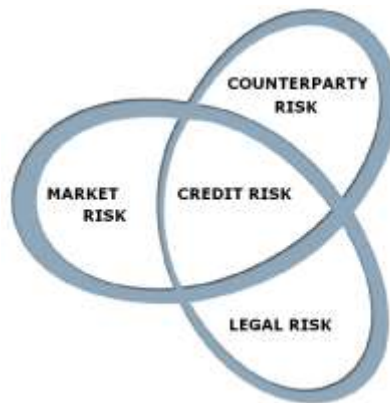
Figure 2: Key Risks in Securitisation

The Key risks in a securitization transaction can be summarized as follows: